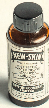
New Skin Bottle