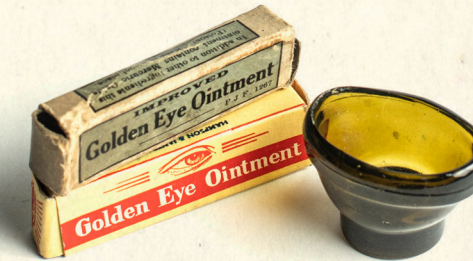
1 Eye Bath and 2 Golden Eye Ointments