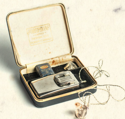
Cymorth Clyw mewn Blwch