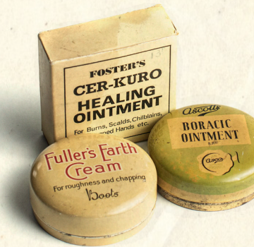
3 Thun o Hufen Iachael