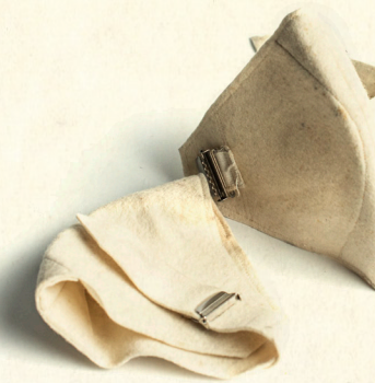
2 o Fresys Defnydd