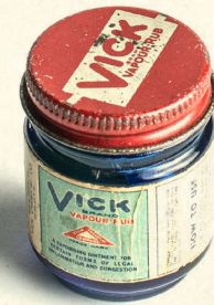
Jar of Vicks