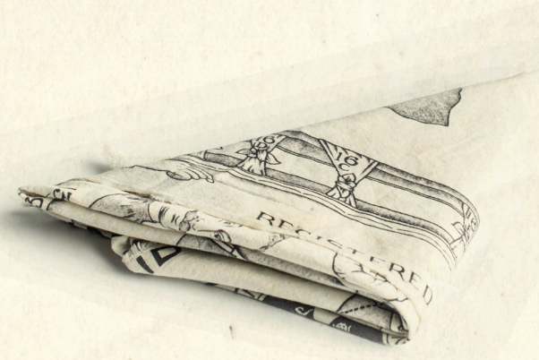
Ambiwlans St Johns gyda chyfarwyddiadau