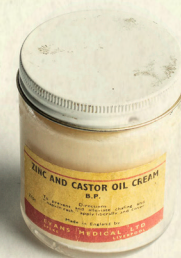
Hufen Sinc ac Olew Castor