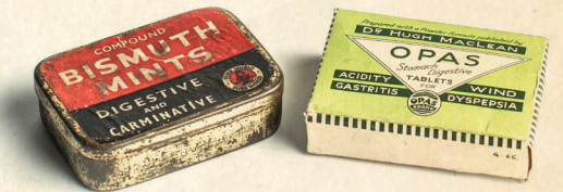
Tun a Blwch o Dabledi Treulio