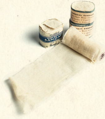
4 Surgical Bandages