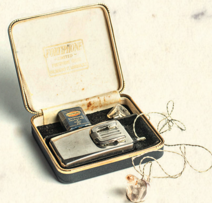
Boxed Hearing Aid