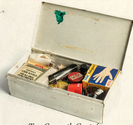
Tun Cymorth Cyntaf

Cofiwch y gall gwrthrychau godi atgofion melyn a chwerw, a theimladau cryf – defnyddiwch eich synnwyr cyffredin lle bo angen.