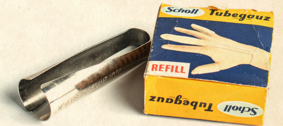
Gwe Tiwb a Thaeuwr