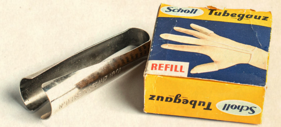
Tube Gauze and Applicator