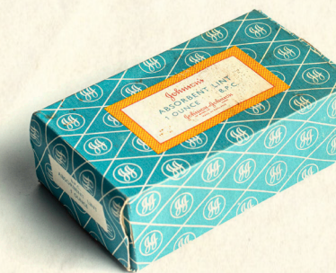
Blwch Lint Amsugol