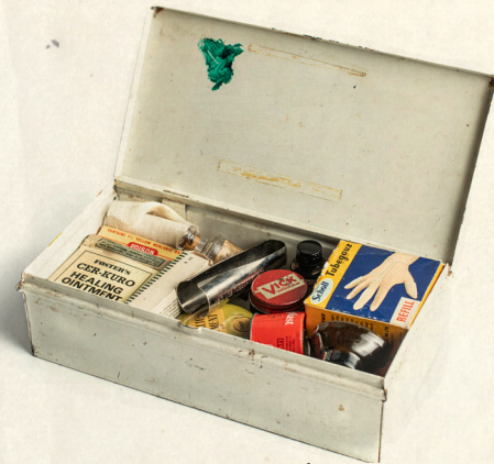
First Aid Tin

Remember that objects can stir both good and bad memories and strong feelings in all of us; use your own judgment wherever necessary.