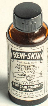
Potel New Skin