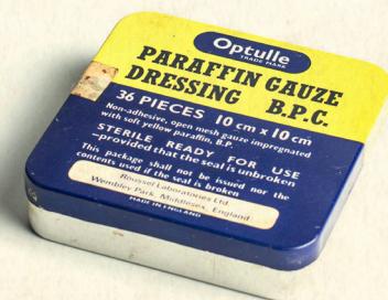
Tin of Paraffin Gauze Dressing