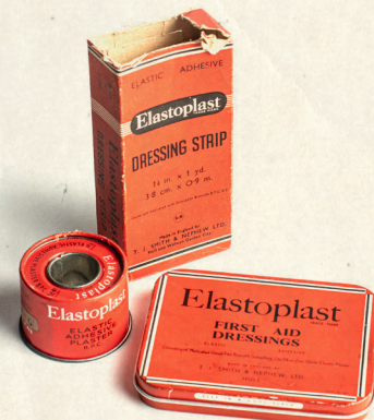
3 Paced o Elastoplast