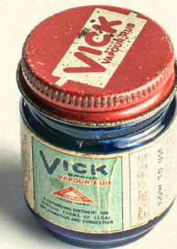
Jar o Vicks