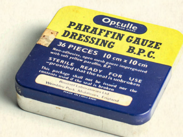
Tun Rhwymyn Gwe Paraffin